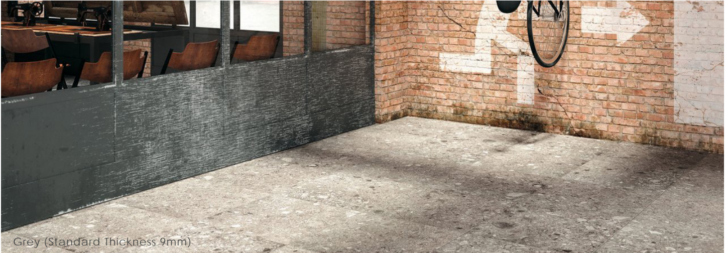
Grey (Standard Thickness 9mm)