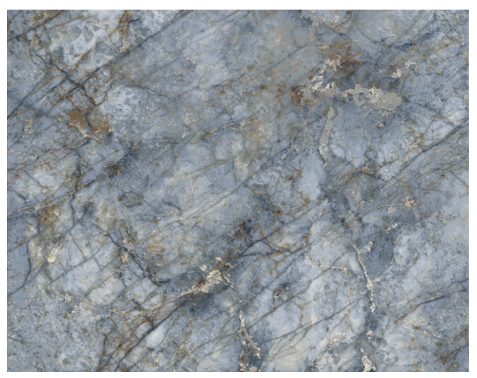
Blue Andes Granite