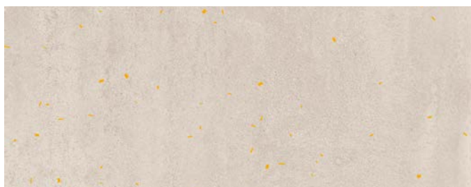
Ivory Gold Fleck