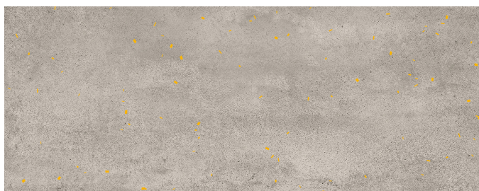
Light Grey Gold Fleck