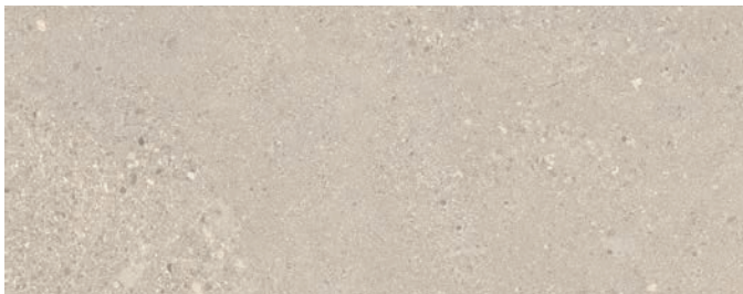
Beige Mixed Aggregate