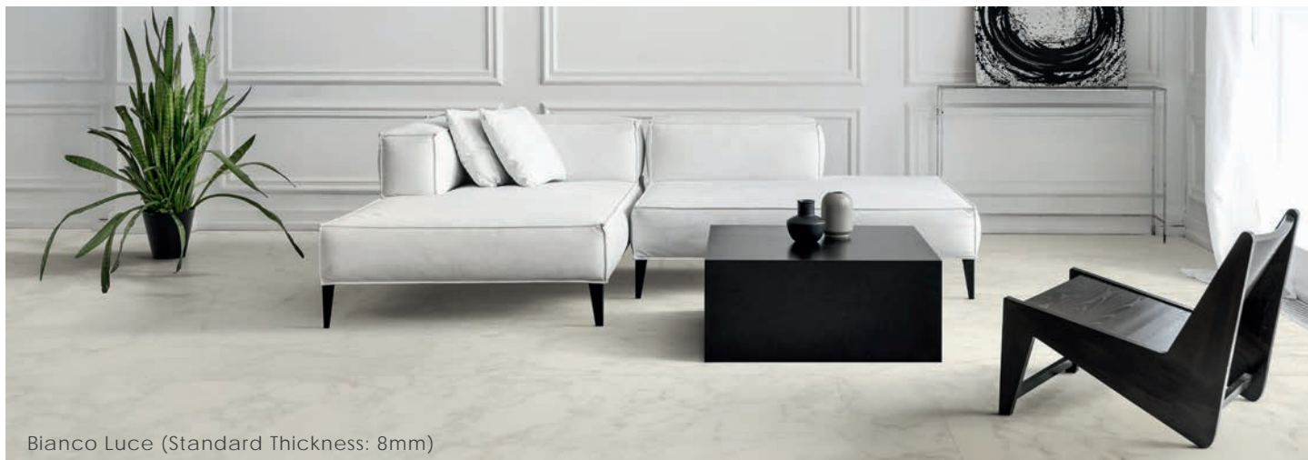
Bianco Luce (Standard Thickness: 8mm)