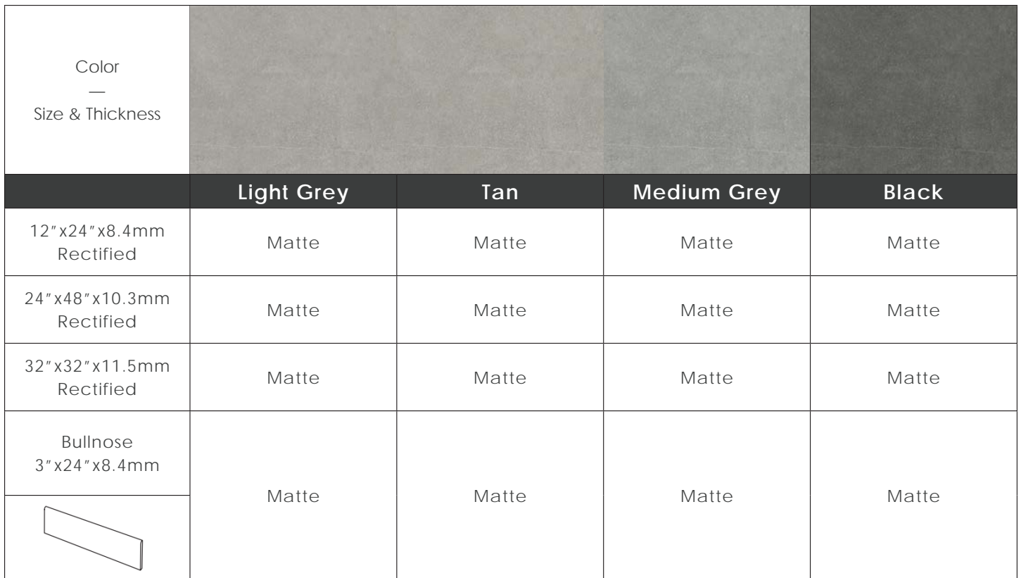
Chart indicates available size, color, finish and thickness options. Shaded block indicates not available. Sizing is nominal for field tile, trims, and decors.