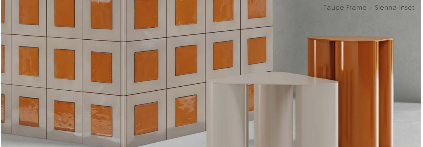
Taupe Frame + Sienna Inset